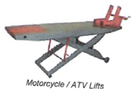
Motorcycle / ATV Lifts

Excellent for Snowmobiles and ATV Repair Table Size: Length: 80 inches, Width adjustable to 4 feet Call (315) 845-1613